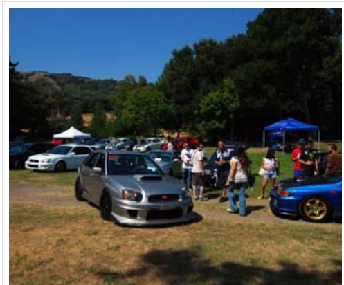
Thank you Bay Area i-club!

Big Thanks to the Bay Area i-club (Subaru Enthusiasts) for their generous donation of $2,000 generated from their raffle at their annual Car Club Meet on Aug. 9, 2009, in Novato at Stafford Lake. Their donation will help FFR save and support many rescue cats and dogs with food, medicine and veterinarian care.