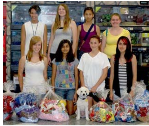
Thank you Girl Scout Troop 30428!

donations to purchase a variety of toys and goodies.