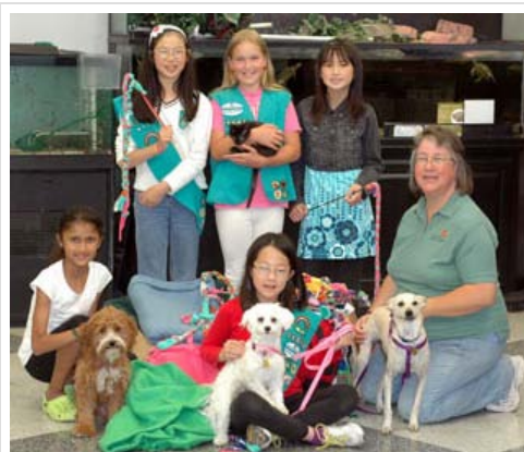
Thank you Girl Scout Troop 31094!

Fremont Girl Scout Troop #31094 collected and made wonderful dog and cat toys for our rescue animals. They presented us with their two large boxes of donations on June 13, 2009 at our adoption showcase at Petco, Fremont.