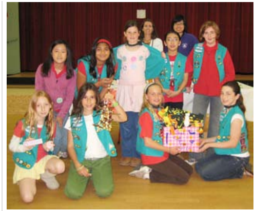
Thank you Girl Scout Troop 60182!